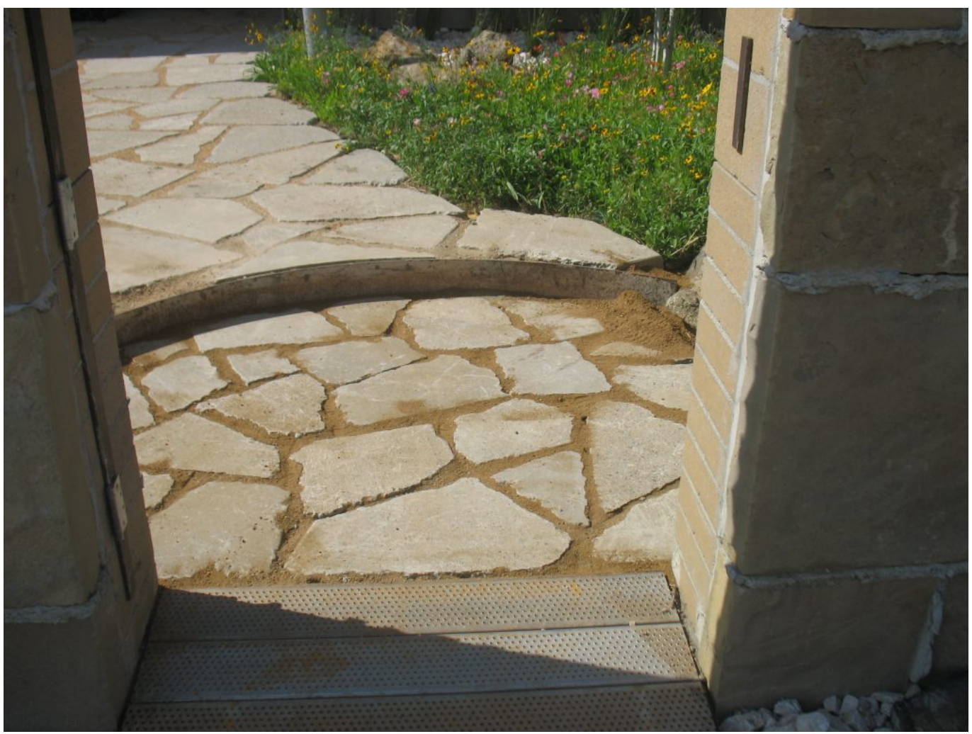
The pieces of recycled concrete had to be broken with a sledgehammer, then reassembled to give a flagstone appearance.

The enclosed patio at the Billing's Public Library was completed in recycled concrete that was set in a sand bed. The pieces had to be broken with a sledgehammer, then reassembled to give a flagstone appearance. The installation contractor says the real challenge was getting the walkway level since each piece ranged in thickness from 4 to 6 inches.