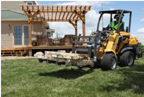
ATX530 Articulated Loader From Vermeer

Visit Booth #5084 Indoors or #7400D Outdoors at GIE+EXPO.