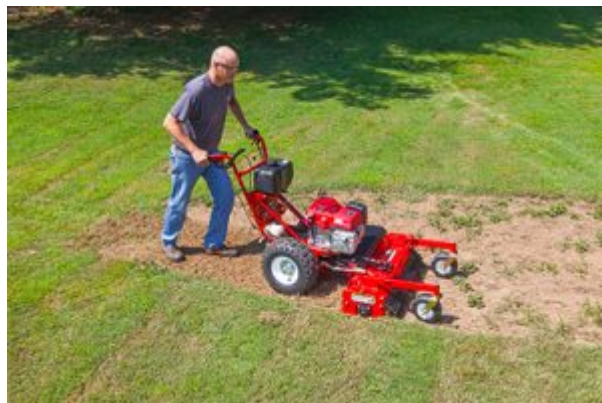
Power Rake From Turf Teq

Designed from the ground up to help landscaping professionals save time and reduce labor needs, the Power Rake from Turf Teq makes quick work of tough fall tasks. Perfect for large raking jobs, seedbed prep, lawn renovation and more, it goes where larger skid steer and tractor-mount machines won't fit.