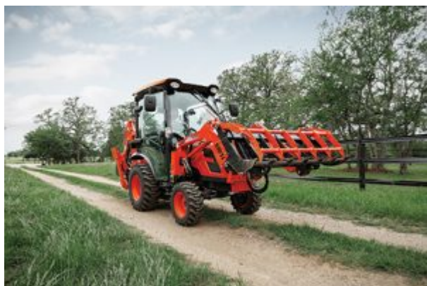
Grapples From KIOTI

Visit Booth #9150 Indoors or #7443D Outdoors at GIE+EXPO.