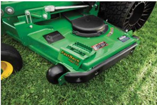
Fastback™ PRO Rear-Discharge Mower Deck

Also check out Turf's Get Equipped Products in: Snow & Ice ; Spreaders , Sprayers & Seed ; and Small Engine & Handheld Equipment for yet more GIE+EXPO exhibitors and new product introductions!