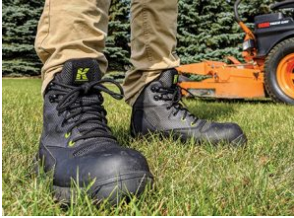
X1 Landscape Boot From Kujo Yardwear

Kujo Yardwear, specializing in footwear for the yard, has released a boot specifically designed for landscapers. Kujo's new X1 Landscape Boot is a lightweight and breathable boot for all day movement that still maintains functionality, safety, and water-resistance. Kujo credits this achievement to focusing exclusively on the Green Industry. Knowing exactly how the boots are going to be used and which features would be overkill, the company removed a lot of excess weight and focused on optimizing the performance for landscapers. In addition to the X1's light weight, another feature that makes the X1 uniquely built for landscapers is the balance of breathability and water resistance. While the toe cap is 100% waterproof, the water-resistant mesh sides allow for breathability and heat release to fight fatigue. Originally launched in all black, Kujo released its Desert Sand color option this past Spring. ( Turf's managing editor received a pair of Kujo Yard Shoes and now wears them regularly for yard and gardening chores. She can attest to their all-day comfort.)