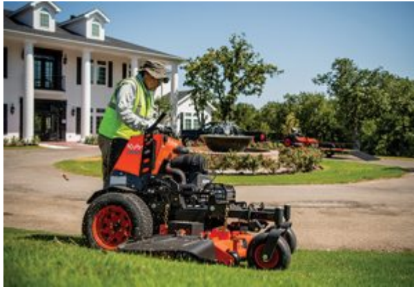
SZ-2 Series Mowers From Kubota

Kubota Tractor Corporation introduces the next generation of SZ Series commercial stand-on mowers with four new models: the SZ19NC-36-2 with a 36" cutting deck; SZ22NC-48-2 with a 48" cutting deck; SZ26NC-52-2 with a 52" cutting deck; and the SZ26NC-61-2 with a 61" cutting deck. Improvements to the SZ Series include adjustable cutting deck baffles, enhanced serviceability, and increased tire performance. The new adjustable baffles allow air intake adjustment of the cutting deck, which affects cut quality and movement of clippings into the bag, out the discharge chute, or onto the ground. Serviceability is improved by making key areas of the cutting deck easier to access and repositioning the hydraulic fluid reservoir inside the mower body. Also new are 23" Zero T tires, featuring a unique tread pattern that provides great balance between handling, grip, and reduced turf impact.