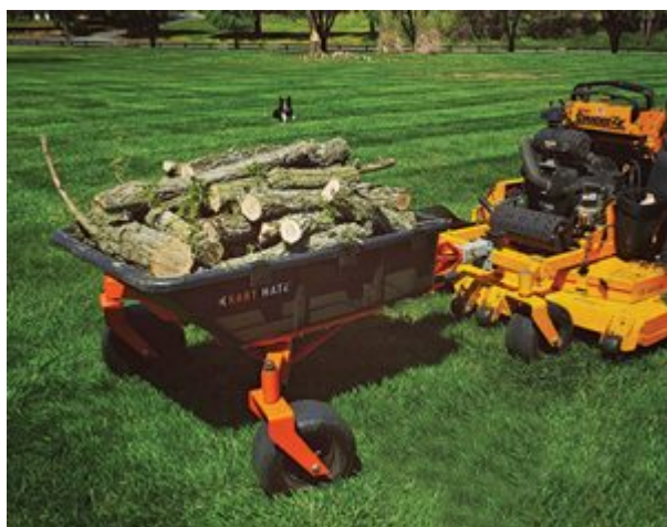
Kart Mate From Dawson Manufacturing

Visit Booth #1110 Indoors or #7834D Outdoors at GIE+EXPO.