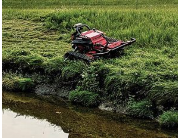
TK-60XP From RC Mowers

Visit Booth #7138 Indoors or #7634D Outdoors at GIE+EXPO.