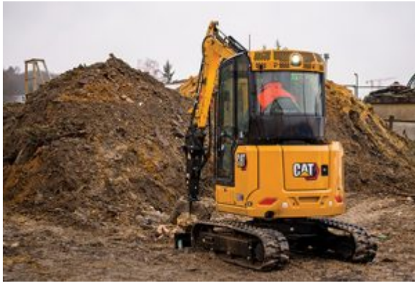
Mini Hydraulic Excavators From Cat®

Boosting operating efficiency, servicing ease, and operator comfort, the new Cat® 302.7 CR, 303 CR and 303.5 CR hydraulic mini excavators introduce new features for the 2.7- to 3.5-tonne class machines. Built on the Next Generation platform that offers a consistent operator experience through the 1.5- to 10-tonne range, each new model features exclusive stick steer, cruise control, operator adjustable settings, and tilt-up canopy or cab as standard. Expanded use of common parts throughout the line, plus a damage-resistant exterior construction, help to reduce parts inventory and lower repair costs. Daily maintenance checks are made from ground level through side doors, while the tilt-up cab design offers access to components for servicing. Increased service intervals mean these excavators spend more time on the job, less time in the workshop. Combined, these features lower total ownership costs up to 5%, while design enhancements deliver up to 10% more performance in travel and trenching. Hydraulic system upgrades improve lifting performance and cycle times, while customizable operator settings improve efficiency.