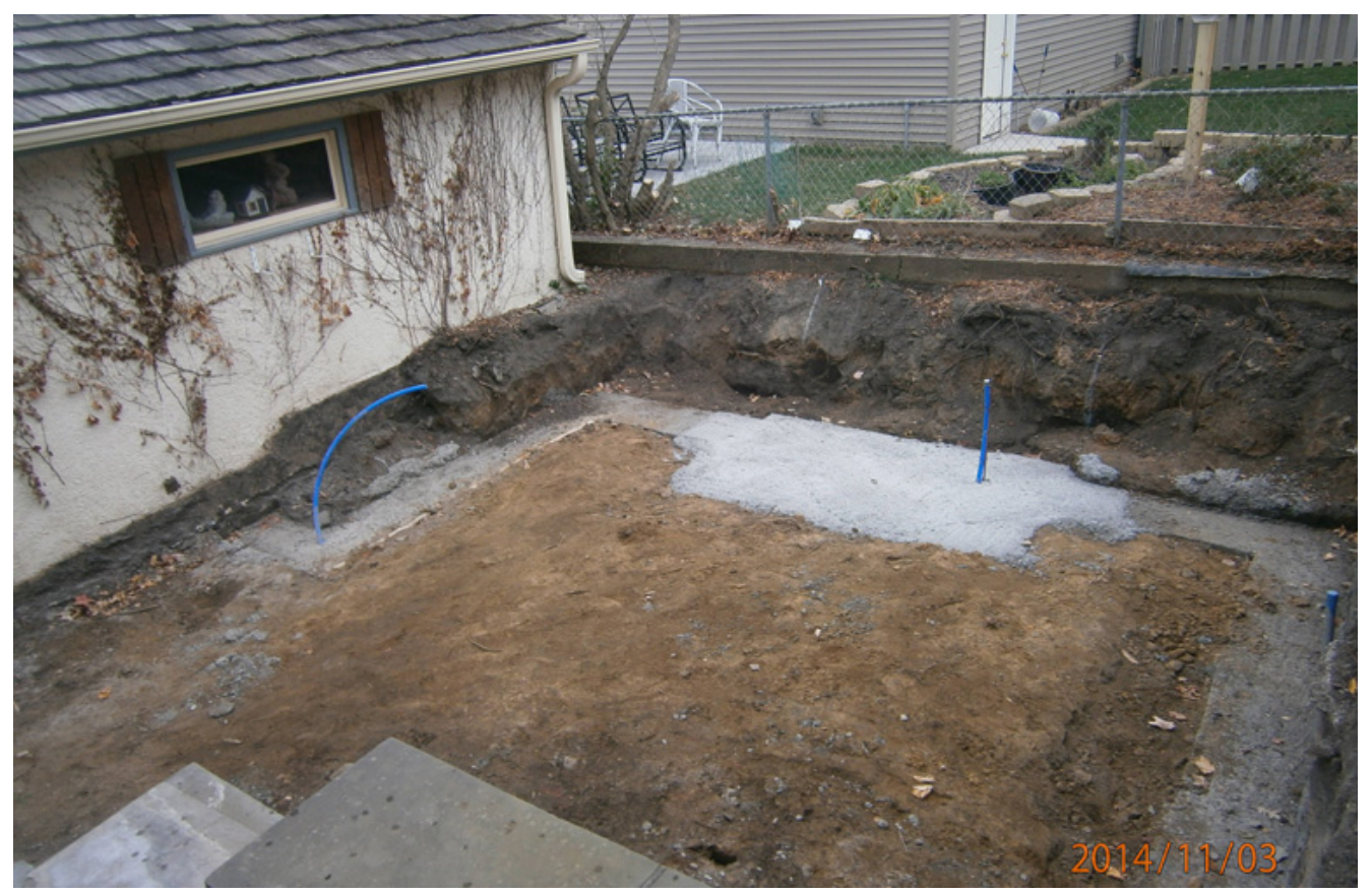
Before the backyard re-do

The designer's vision of the space included gas lamps, red brick, wroughtiron and a water feature. The gas lamps were an especially good choice.